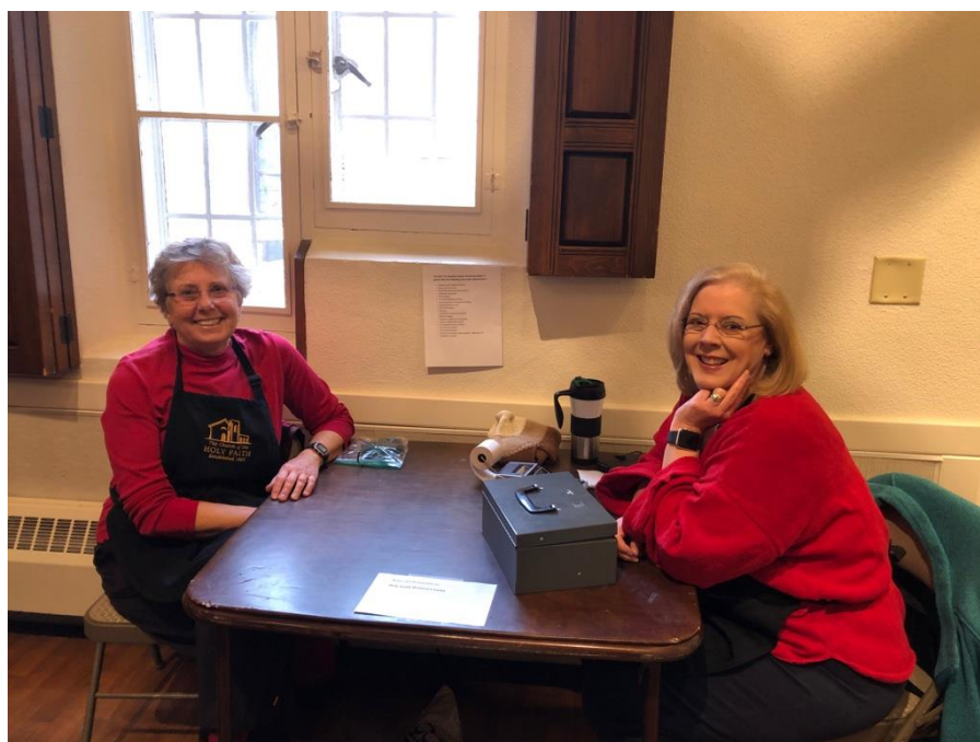
ADVENT LESSONS AND CAROLS RECEPTION – DECEMBER 9, 2018