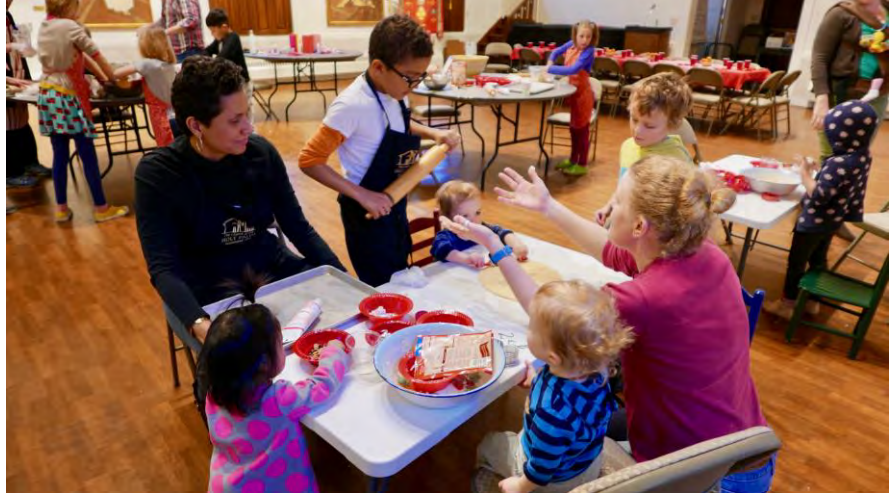
LAST BUT NOT LEAST – CELEBRATING THE BAPTISM OF THE CONDIT GIRLS APRIL 28, 2019