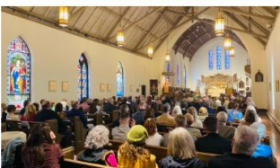
Also during Holy Week: Holy Eucharist on Monday at 6pm; Mass of Collegiality on Tuesday at 12noon; Taizé Eucharist on Tuesday at 6pm; and Pilgrimage to Chimayo on Wednesday at 9am.